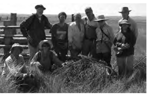
Volunteers take a well-earned break after a full day of removing fences at Sycan March Preserve.