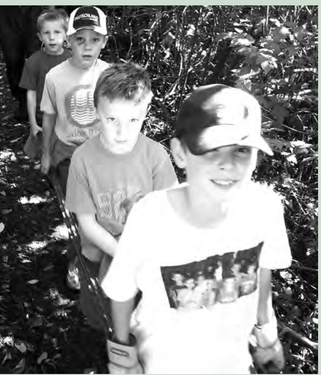
The next generation of Nature Conservancy volunteers carries supplies up the Cascade Head Preserve trail in preparation for a busy day of pulling weeds on the grassland.

Want to help protect biodiversity while you hike? Become a weed watcher! Prevent the establishment of invasive plants by surveying for and reporting new infestations at Portland and Medford area preserves. Training opportunities: Camassia, Sandy River Gorge & Tom McCall preserves: Sat., June 2 Lower Table Rock & Agate Desert preserves: Sat., May 19