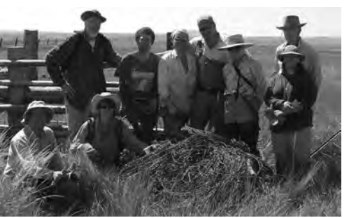
Volunteers take a well-earned break after a full day of removing fences at Sycan March Preserve.